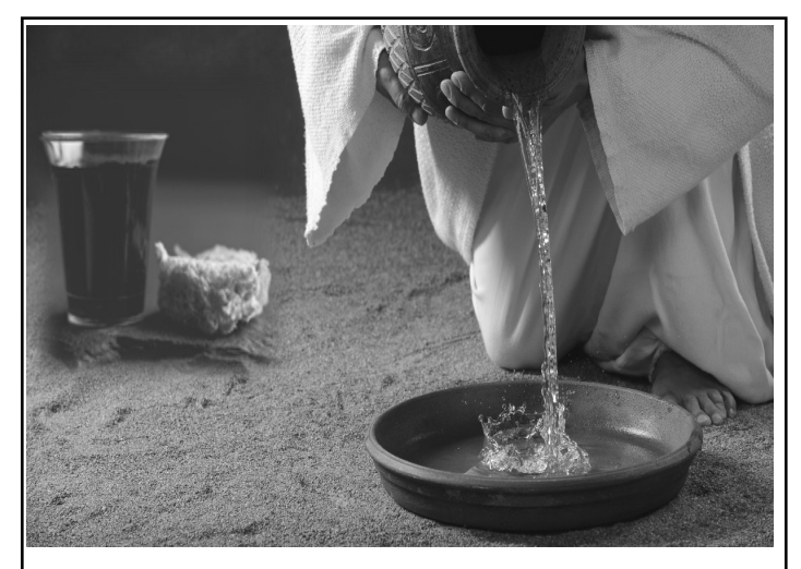
FOOT WASHING AND COMMUNION SERVICES First SONday of the Month,

Tune in to listen to Journey For Christ Radio Ministry on our own Internet Radio Station at any time.