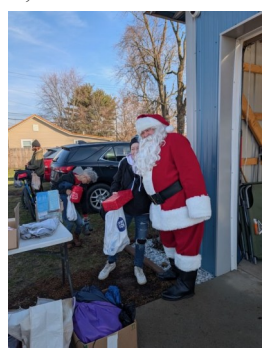
December 22nd, Angel Tree Outreach, donated gifts for Children of incarcerated parents.