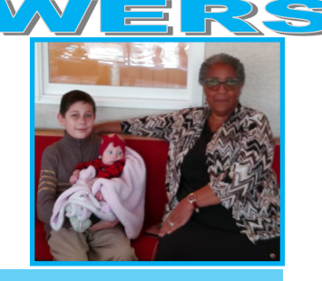
For The Naranjo Family