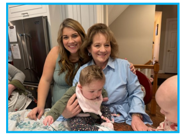
For The Stein Family